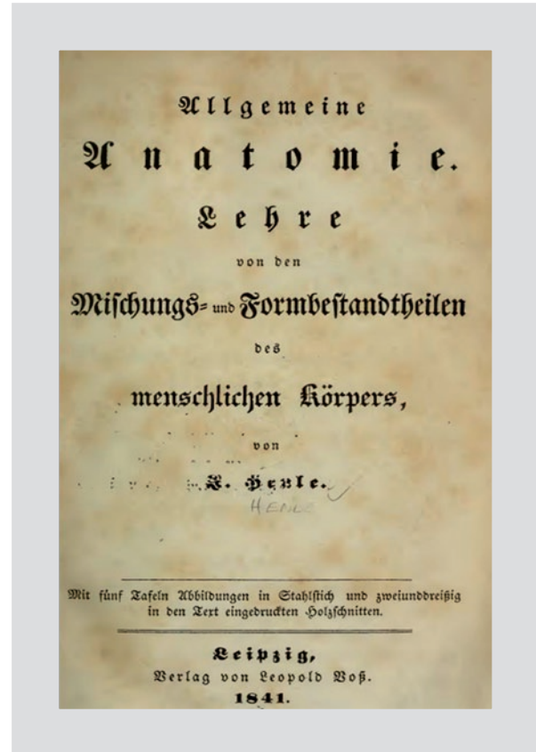
Figure 3. Cover of the book Allgemeine Anatomie (General anatomy), published in Zurich in 1841. It was the first text dedicated to histology, where Schleiden and Schwann's then recently described cell theory was presented.

It is possible that due to his incarceration Henle was not happy in Berlin, and in the spring of 1840, just