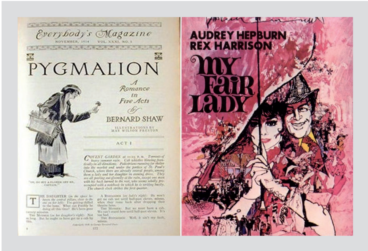
Figure 2. The My Fair Lady movie and the Pygmalion play.

At the University of Bonn, Henle was an active member of the fraternity Burschenschaften , a type of association inspired by liberal and nationalistic ideas; Jacob accepted the bravery and honor tests imposed by the fraternity and took part in combats putting his life at risk. Thanks to his anatomical works, we know that young Henle was very skilled with the knife at the dissecting room, but he did considerably less well when he engaged in duels, since once he received a wound to his right cheek that branded him for life; in photographs he appears almost always turning his face right, possibly to cover the wound.