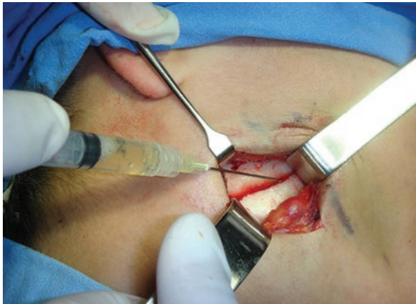
Figure 2. Platelet-rich plasma application on the fracture line before reduction and fixation.

experimental group; the rest comprised the control group ( p = 0.84 ). In the experimental group, the age was 32 \pm 11.3 years, and 31.2 \pm 8.48 years for controls ( p = 0.76 ). The place where the lesion occurred was analyzed, with 2 (10%) being found to have occurred at the workplace and the rest 18(90%) somewhere else. The lesion mechanism was aggression in 7 cases (35%), accidental falls in 6 (30%), motor vehicle accidents in 6 (30%), and not explained in 1 (5%). Mandibular angle fracture occurred on the right side in 8 patients (40%) and on the left side in 10 (50%), and it was bilateral in 2 (10%).