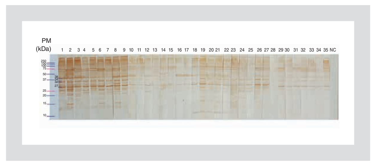
Figure 2. Western-blot of 35 T. cruzi-reactive sera. NC: negative control.