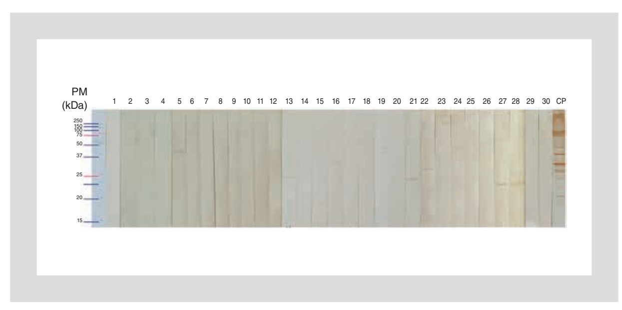
Figure 3. Western blot of 30 NR to T. cruzi sera. PC: positive control.

higher than 70% were obtained, and a maximum certainty point was attained with the 32 kDa component (Table 6).