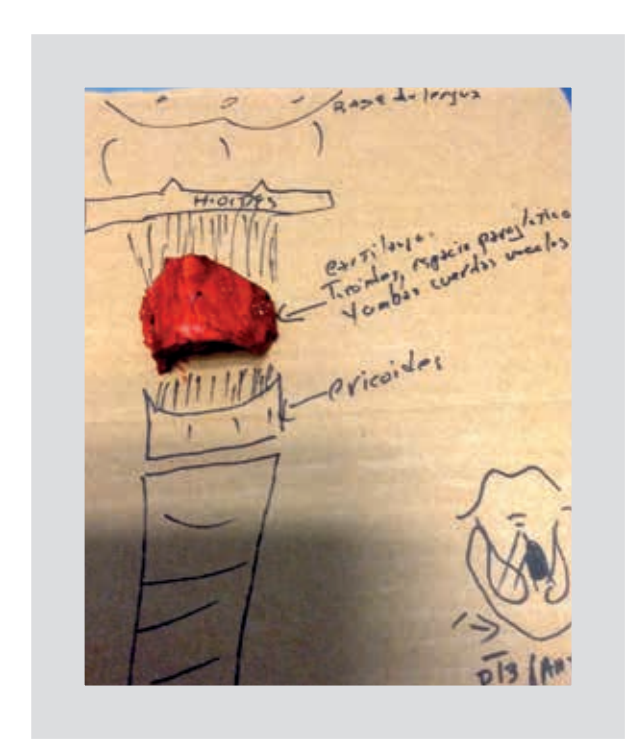
Figure 1. Subtotal laryngectomy specimen with adequate orientation for histological study.

paraglottic space; and glottic and subglottic lesions, the infraventricular paraglottic space. Infiltration into the anterior commissure occurs in the insertion region of the cricothyroid ligament, which is a site of larynge-al weakness and from where it can advance towards the extralaryngeal region and destroy the keel of the thyroid cartilage.