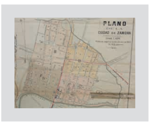
Appendix 2. Map of Zamora, 1910. Map of Zamora in 1910 divided into 4 quarters. As it can be appreciated in the map, the Civil Hospital is located in the third quarter (III), represented by the letter d next to a black cross symbolizing the La Purísima parish. The location streets in the map are Colón avenue almost at the intersection with Francisco I. Madero.