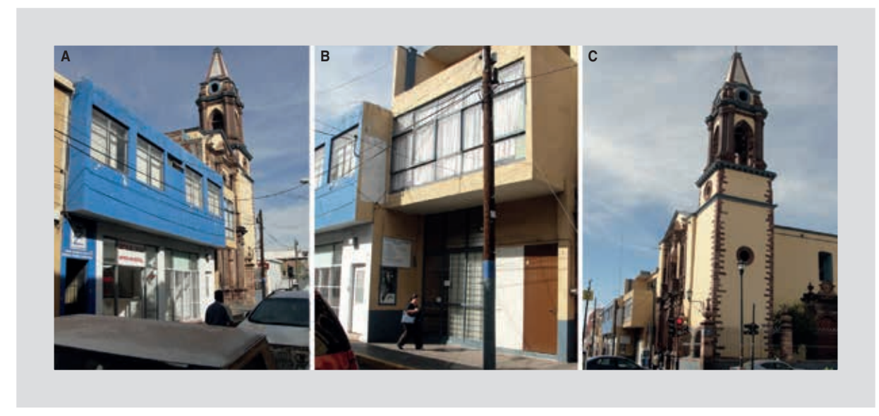
Appendix 3. A: Former location of the Civil Hospital. B: Parish offices. C: Purísima Concepción temple.