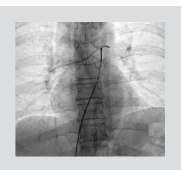
Figure 2. Fluoroscopic image of catheter fragment fixation with the loop catheter.

A bad positioning of the catheter across this space from outside of the subclavian vein before medially