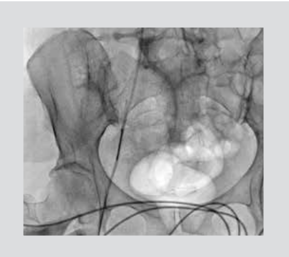
Figure 3. Extraction of the catheter fragment with a loop catheter through the femoral venous access.

Grade 0, the catheter follows a trajectory across the region of the clavicle and the first rib with no narrowing.