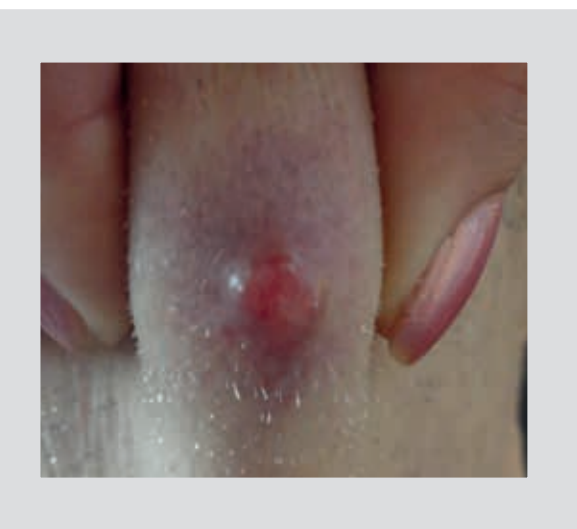
Figure 2. Subcutaneous neoformation with erythematous-violet coloration, hard consistency, non-adhered to deep plains, of approximatedly 3 cm in diameter, well-defined margins and central thinning of epidermis, through which some blood vessels are observed.

The patient referred he had noticed the lesion one month before though it was smaller in size. Initially, the lesion had an accelerated growth and subsequently the patient tried to squeeze it without obtaining any material.