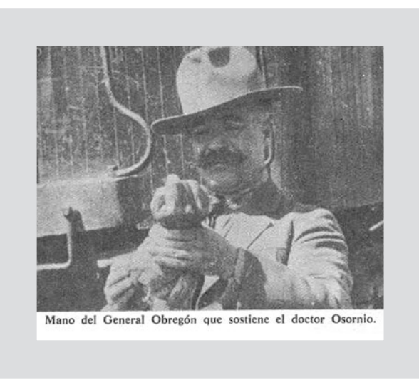
Figure 1. Lieutenant Colonel Enrique C. Osornio, MD, holding General Obregón amputated limb.