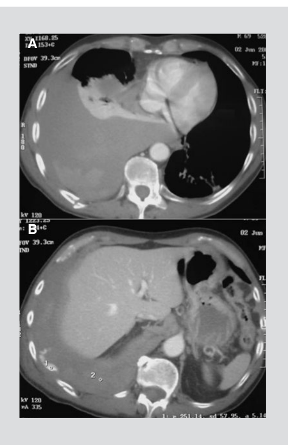
Figure 4. A: 5-meter-fall polytrauma patient who underwent computed tomography scan with intravenous contrast medium, where right costal fractures and post-traumatic hemothorax are demonstrated. B: 5-meter-fall polytrauma patient who underwent computed tomography scan with intravenous contrast medium, where right costal fractures, post-traumatic hemothorax are demonstrated, with identification of the blood extravasation site, characterized by evident hyperdense images on the right pulmonary base.

the emergency zone, and the personnel in charge of operating the apparatus was not always available when it was required, although this situation, by the way, has already been analyzed, demonstrating that CT cost-effectiveness is not influenced by its location and doesn't impact on bedridden days<sup>17</sup>. Even the philosophy of ATLS suggested this at its beginnings. The advent of faster, multi-slice, multi-detector new CT equipments went on making the technique increasingly accessible, in addition that the quality of images went on becoming increasingly better. The possibility to reconstruct obtained images even in three dimensions has made it an indispensable tool in all trauma wards. The beginning of the 21<sup>st</sup> century marked the advent of those technologies based on faster equipments,