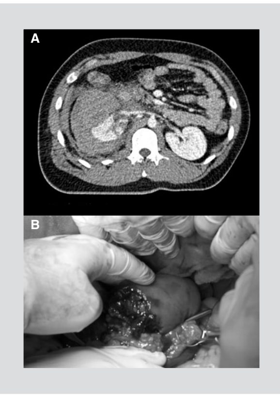
Figure 1. A: Motor vehicle-runover polytrauma patient who underwent thoracoabdominal multiphasic computed tomography scan with intravenous contrast. Right kidney is demonstrated with morphology loss from the cortex to its lower pole, with a perirenal hematoma; B: Motor vehicle-runover polytrauma patient with right renal surgical bed image, where tearing is appreciated at the interpolar junction level, with upper pole preserving its usual coloration.

CT is, since many years ago, the gold standard for the diagnosis of thoraco-abdominopelvic injuries. Originally, given the characteristics of equipments, CT was reserved only for those patients with hemodynamic stability. CT has allowed for organ-specific injuries to be assessed and categorized and for selective treatments to be carried out, and enables assessing both the peritoneal cavity and the retroperitoneum. It has a sensitivity to detect intraperitoneal bleeding higher than 90%%. In addition, it enables assessing renal function and contrast leaks and considering the need for minimally invasive procedures in selected cases of injury to pancreatic, renal, hepatic<sup>13</sup> or splenic<sup>14</sup> viscera (Figs. 1 A and B, 2 A and B, and 3 A and B).