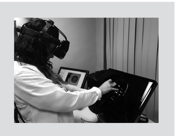
Figure 1. Indirect ophthalmoscopy simulator for the training of ocular fundus examination.

To be used in ophthalmology, simulators first have to be validated by documenting, for example, the